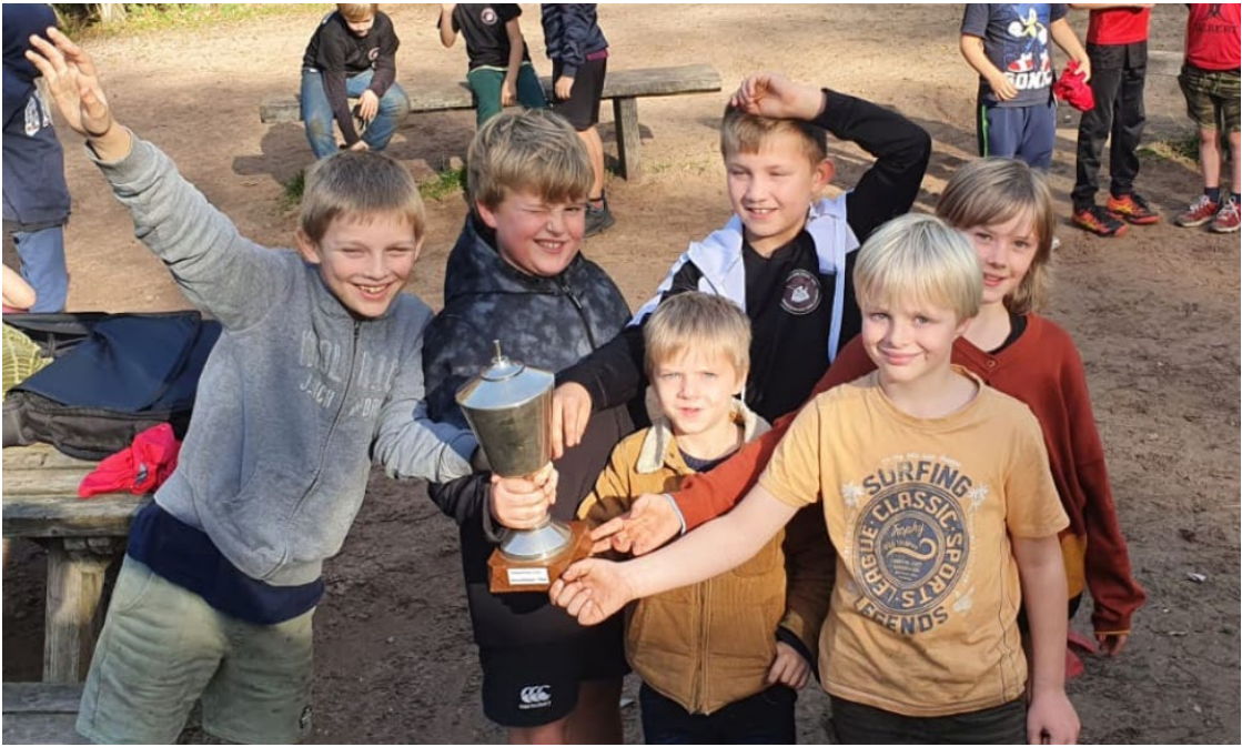
De winnaars van de HAGELSLAGCUP 2022